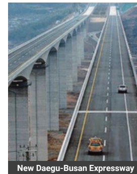
New Daegu-Busan Expressway