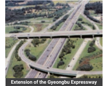
Extension of the Gyeongbu Expressway