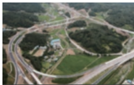
Gyeongchun National Highway