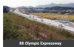
88 Olympic Expressway